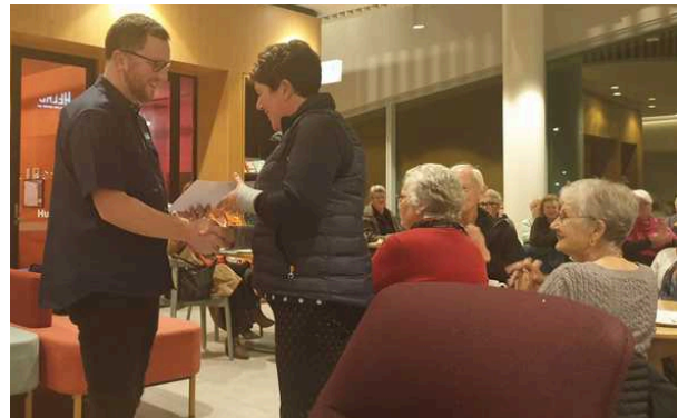
Selwyn Big Shout Out, June 2023