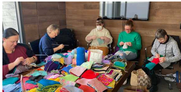
Volunteer Knitters, Knit for Purpose 2023

A particular highlight during the year under review was the successful 'Knit for Purpose' campaign which was launched on Micro Volunteering Day in April and ran through until World Wide Knit in Public Day in June. Collaborating with the Volunteering Mid-South Canterbury team, people were invited to contribute to knitting peggy squares, whether through providing materials, knitting or sewing the completed squares into blankets. In Otautahi Christchurch, people knitted at home or got together in schools, libraries, prisons and workplaces to contribute to this project, which resulted in the handing over to community groups of 14 handknitted blankets for passing on to their clients.