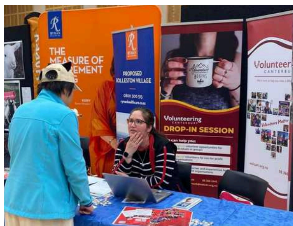
Selwyn Swell Expo, October 2023

In support of volunteering in the wider Selwyn District we attended a number of locally-run events alongside other local community organisations. At the Swell Expo, we engaged with over 80 individuals as we promoted volunteering as a means of improving wellbeing and decreasing social isolation in the over 65s population. At the Selwyn CultureFest we promoted 'Bags of Hope' for the Selwyn Cancer Centre, resulting in 94 bags beautifully decorated for their cause.