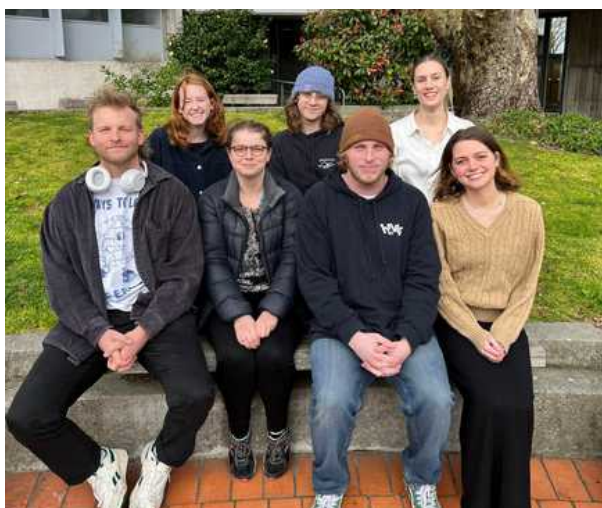
Student team from NZ Broadcasting School

Another highlight was the opportunity to work alongside an amazing group of young people studying at NZ Broadcasting School. In a period of six weeks the students put together a remarkable range of collateral (including 16 short videos which can be viewed on You Tube) in a campaign entitled 'Make Your Mahi Have Meaning' which was launched to mark Volunteering Canterbury's 35th anniversary. This material has been well-received, a delight to share and completely met the project brief: to celebrate the diversity of volunteering happening across Waitaha Canterbury every day.