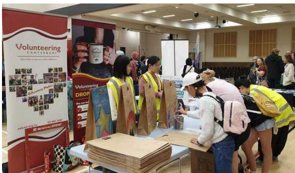
Volunteering Canterbury stall, CultureFest Lincoln

Within our region, we attended 15 community events/expos during the year, and made 29 presentations to nearly 800 people. The Tautoko Network: Supporting the Community Sector and the Governance Bites series (supported by The Rata Foundation) attracted over 220 participants who support their organisations in either governance or volunteer management roles.