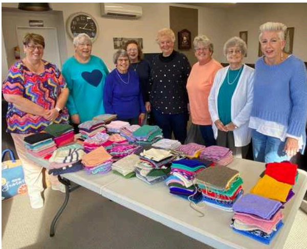
Selwyn Knit for Purpose participants, June 2023

Knit for Purpose was a popular project in Selwyn, with a local retirement village leading the charge, creating many squares, which were then sewn together at a group event in June. The new Selwyn Primary Birthing Unit “Oromairaki” was the beneficiary of the blankets made within the Selwyn district. It was wonderful to see the William Pike Challenge students, and local high school students also contributing enthusiastically to this project.