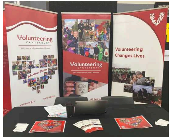
A Volunteering Canterbury public display