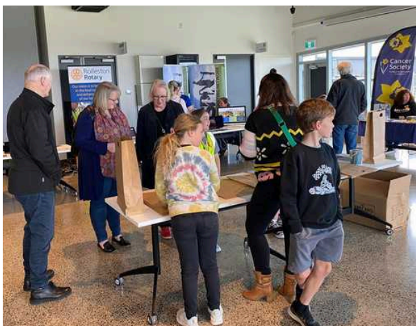
Selwyn Newcomers Expo, September 2023

Embracing new beginnings in the Selwyn District, we held our first ever Newcomer's Volunteer Expo, with twenty local not-for-profit organisations in attendance. The focus was on showcasing the ways in which volunteering can help newcomers to meet people, make connections and gain valuable skills to help them settle in. Approximately 80 newcomers joined us to talk with organisations and take up local volunteering opportunities.