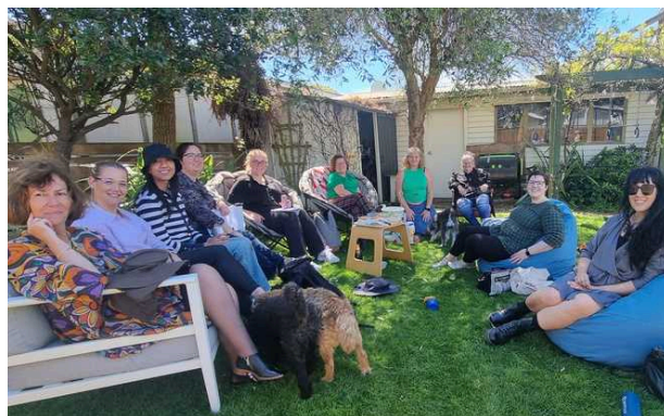
Volunteer Centre Network Aotearoa (VCNA) Hui

The year under review has seen a 'settling' after the tumultuous years resulting from the global pandemic and, despite a constrained economic environment, people have remained generous with their gifting of mahi aroha to community organisations across Waitaha Canterbury. Membership by community organisations has sat within the range of 267 – 272 through the year (compared to 260-268 in the previous year) although there has been a steady increase in the utilisation of services, such as training and information programmes, by non-member organisations.